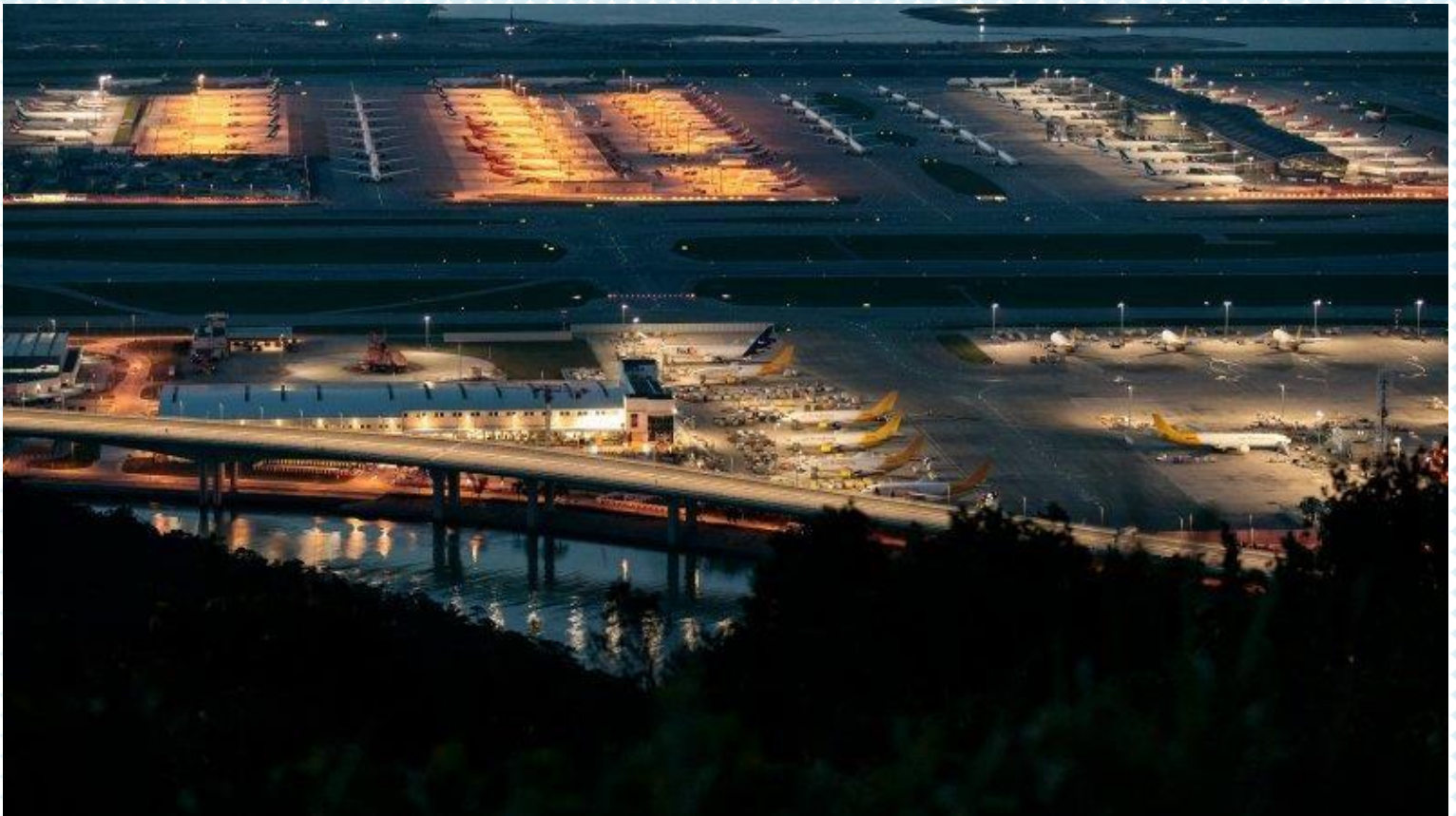
An overview of Hong Kong International airport on April 12, 2020.